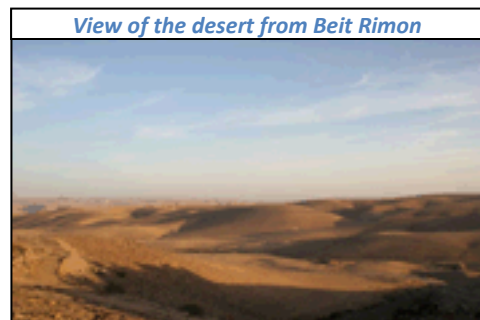
View of the desert from Beit Rimon

visiting Israel there has been a wonderful experience there of greater reality due to the aspects of servanthood, prayer/worship and daily practical application rather than just visiting in big hotels.