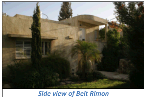
Side view of Beit Rimon

Our Base Petach Tikva (meaning Door of Hope) in the Cape area of South Africa continues to be used in the most unconventional way in bringing forth HOPE IN OUR LIVING GOD for believer and unbeliever, and also gets used in many ways to be a blessing to community members.