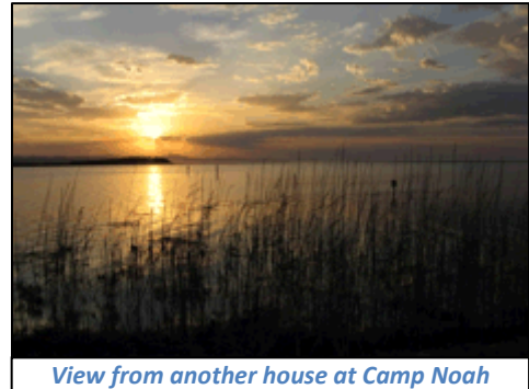
View from another house at Camp Noah

This will be called Camp Noah . It is at a paradise locality on the river, the sea and nature reserve with various homes that we have transformed from being a literal dump yard into the most beautiful holiday destination with nothing man-made amongst the homes but total nature at its best - an estuary of birdlife, a fishing haven and the